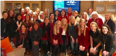
Gamma Phi Beta | Annual Christmas Party