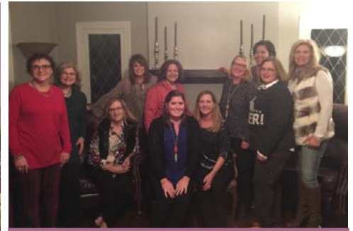
Alpha Phi | Christmas Party