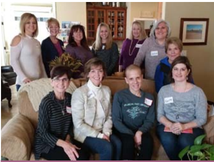
Alpha Chi Omega | 2018 Planning Brunch