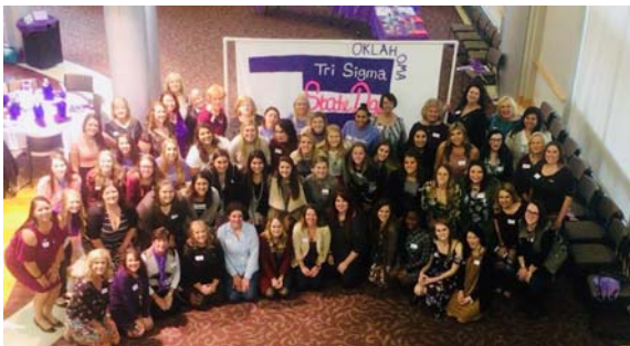
Sigma Sigma Sigma | Tri Sigmas at State Day in Tulsa represented from 3 alumnae & 3 collegiate Chapters across OK