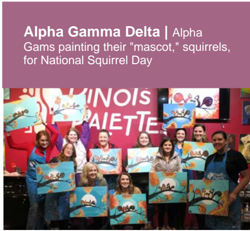
Alpha Gamma Delta | Alpha Gams painting their "mascot," squirrels, for National Squirrel Day