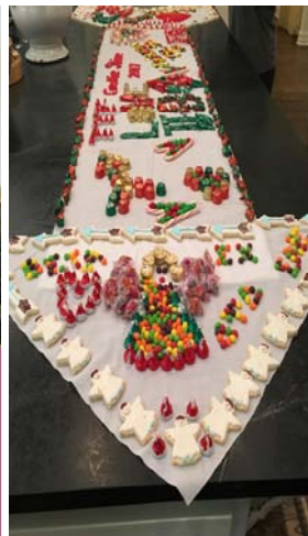
Pi Beta Phi | Cookie Shine Event (Pi Phi tradition started at the University of Kansas in 1872)