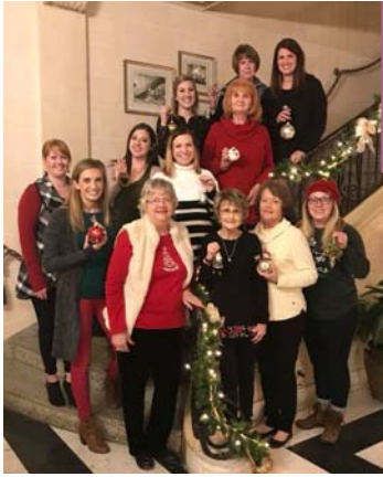
Alpha Sigma Alpha | Alpha Sig Alumnae at the Tulsa Garden Center for their Christmas Ornament Exchange