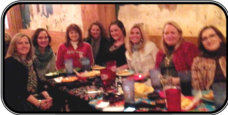
Alpha Phi's enjoying dinner at El Guapo in February.