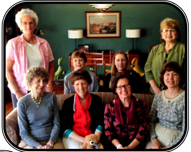
Alpha Xi Delta alumnae at their fall meeting.